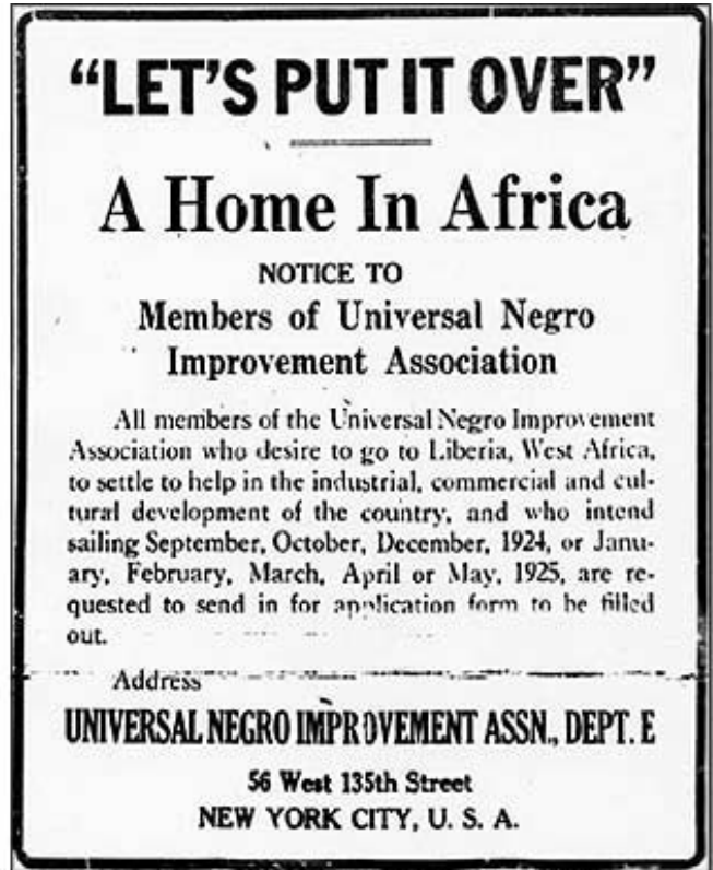
THE MARCUS GARVEY AND UNIA PAPERS PROJECT

Let us identify InI competent leaders with vision and empower and cooperate with them.