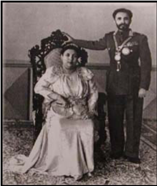
Their Imperial Majesties Emperor Haile Selassie I And Empress Menen

"The very diversity of the worlds peoples today constitutes one of mankind's great resources; the different philosophies with which nations approach their problems lead inevitably to a vast array of methods and techniques. These variations are necessary, for each people must find solutions which are responsive to its particular needs... each nation will inevitably pursue that course which appears best suited to its own unique characteristics, but no nation can pursue its course in isolation, and no nation can develop and prosper with its back turned to the rest of the world in terms of trade, techniques, resources and ideas. Each of us depends on the other, can learn from the other, and in pursuing it's own destiny will go further and succeed more quickly with others. Indeed, the free exchange of support and ideas is an essential condition to world understanding and equally to world progress."